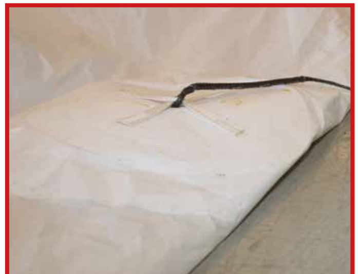
A. Upper pad

See also User Guideline: "How to refit your gennaker with a Backtail line"